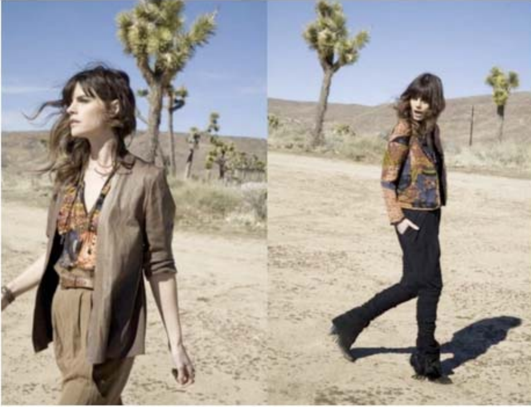
Washed leathers and vintage-inspired boleros.