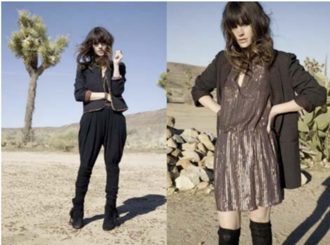
Shimmer frocks toned down by boxy, boyfriend-inspired blazers.