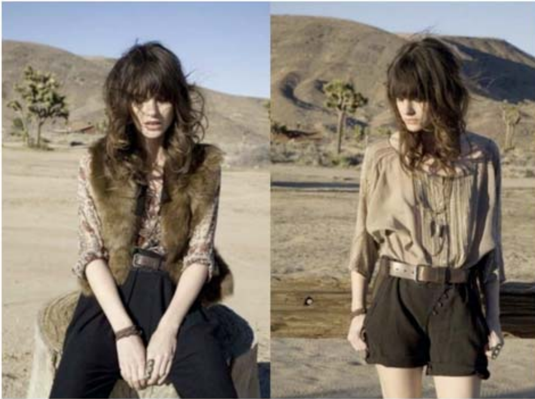
Shorts adorned with button detail add interest while loose, peasant-inspired tops keep the looks fresh and relaxed.