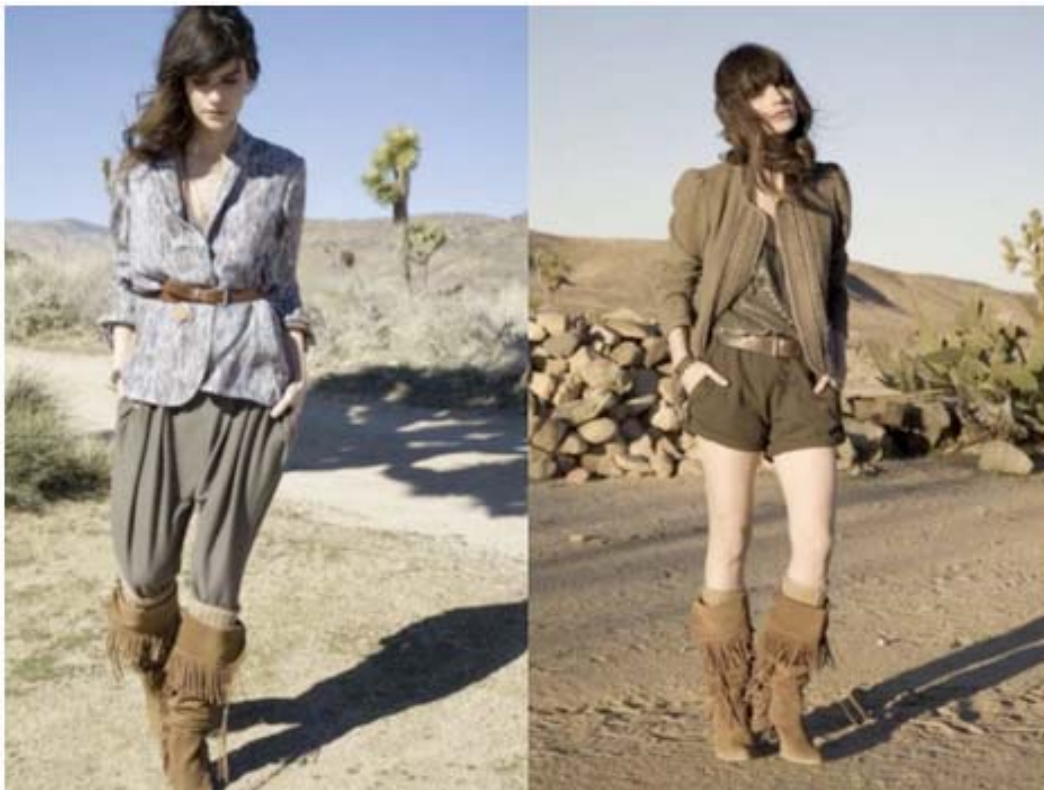
Structured harem pants stay fresh into fall when paired with a feminine belted jacket.