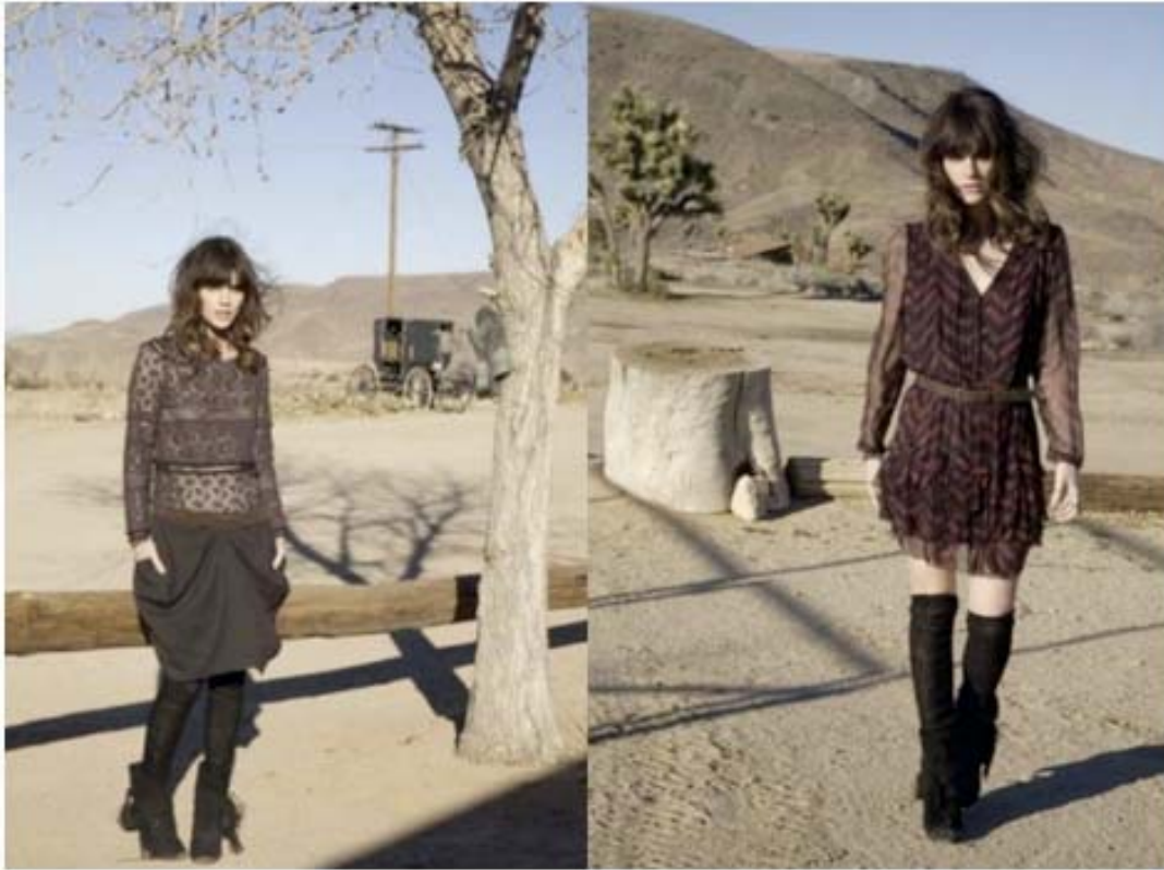
Moon's collection favorite: the Daria dress in a serpent snake print