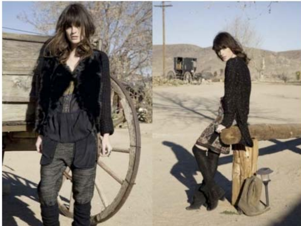
Luxe layering with fur accents.